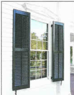
Custom-milled pediments over windows are authentic replicates.