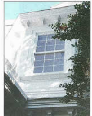
A rebuilt concealed gutter and custom brackets make the bay window a focal point.